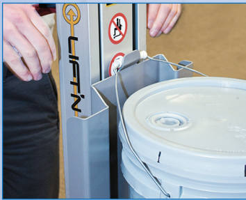
Pail retainer keeps loads secure.