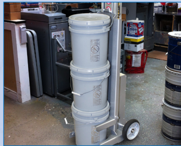
200 lb. lifting capacity safely handles 3 pails at a time.