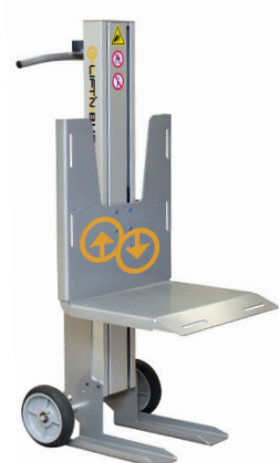
Lift'n Buddy LNB-2