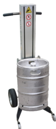
Lift'n Buddy Keg Lifter