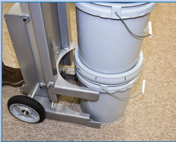
Lifting yoke holds pails in place.