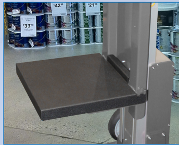
Optional platform for loose cans or other case packed goods.